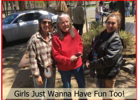
Girls Just Wanna Have Fun Too!