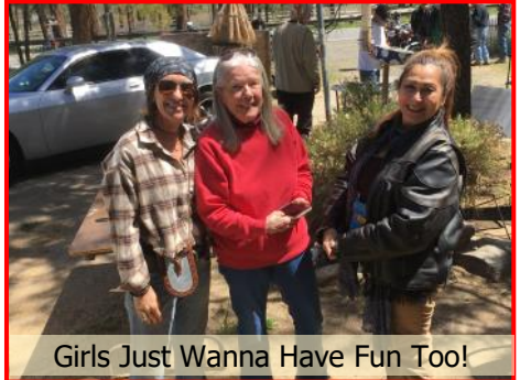
Girls Just Wanna Have Fun Too!