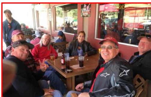
"Lunchtime Professionals" at work

gig? The ride from Doffo to the finish took about 15 minutes and we helped each other load up and put another ride into the books. For many, the IE Ride offers the kind of ride you want it to be, as it can be a challenging twisty and high-speed road or a great touring and scenic ride through the forest. Perhaps we shouldn't choose one over the other and do both rides as an IE Mountain and IE Pie Run? Maybe also incorporate some routes from the recent Stagecoach Rally to shake things up a bit? Please weigh in and let me (or a club official) know your thoughts on this.