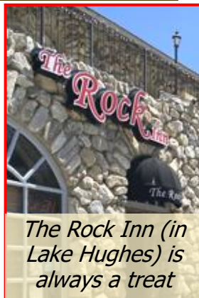
The Rock Inn (in Lake Hughes) is always a treat

With skies as nice as ever, we should have had 100 riders, but those who showed up had a good ride.