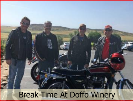
Break Time At Doffo Winery