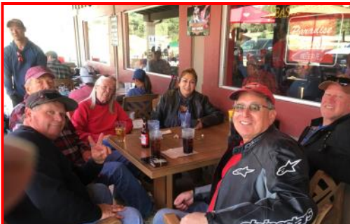
"Lunchtime Professionals" at work

"tour group" took the option and stopped by the Doffo Winery to check out their display of fine motorcycles and engage in a long discussion with a Ural mounted tour driver, dragged out the good times for a little bit longer. We did find out that they do need more drivers, so perhaps some readers may be interested in calling and discussing a part-time