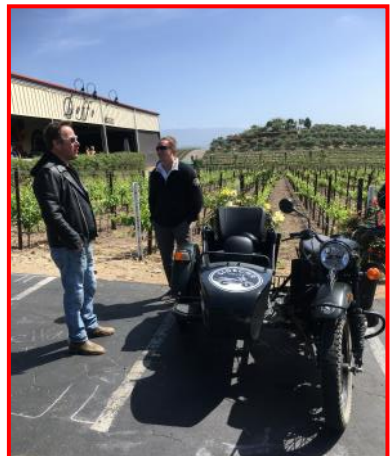
Ural Tours Anyone?

gig? The ride from Doffo to the finish took about 15 minutes and we helped each other load up and put another ride into the books. For many, the IE Ride offers the kind of ride you want it to be, as it can be a challenging twisty and high-speed road or a great touring and scenic ride through the forest. Perhaps we shouldn't choose one over the other and do both rides as an IE Mountain and IE Pie Run? Maybe also incorporate some routes from the recent Stagecoach Rally to shake things up a bit? Please weigh in and let me (or a club official) know your thoughts on this.