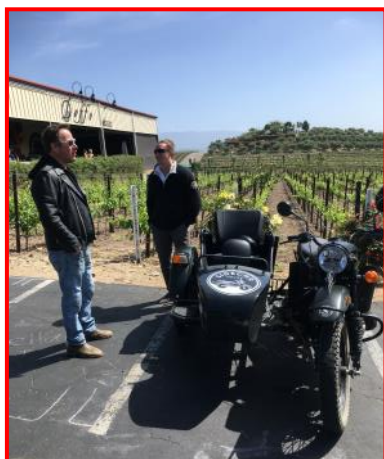
Ural Tours Anyone?