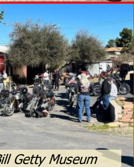
Bill Getty Museum