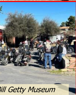
Bill Getty Museum