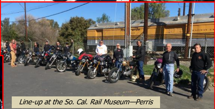
Line-up at the So. Cal. Rail Museum—Perris