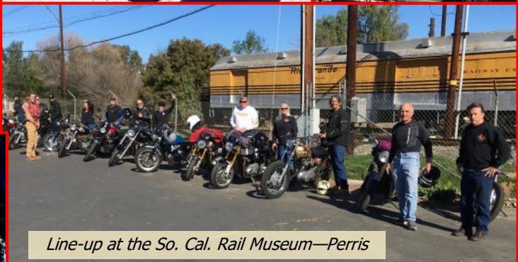
Line-up at the So. Cal. Rail Museum—Perris