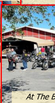
At The B