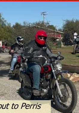
out to Perris