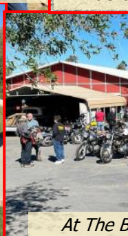
At The B